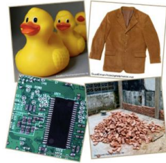
Chemicals in Products