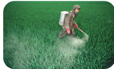
Highly Hazardous Pesticides