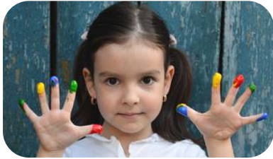
Lead in Paint