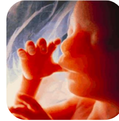
Endocrine Disrupting Chemicals