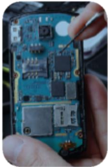
Lifecycle of Electronics