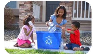
Perfluorinated Chemicals (PFCs)